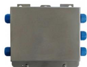
ATEX JUNCTION BOX