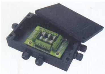
ALUMINIUM JUNCTION BOX