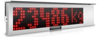
WA-2 Professional Inox